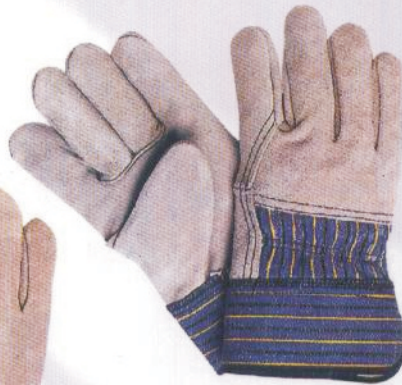
ART # 788