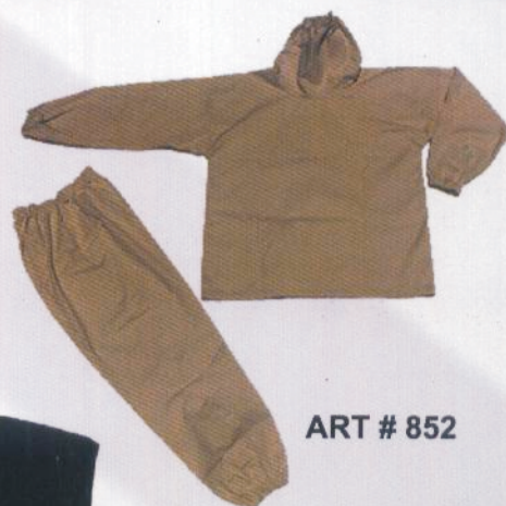
ART # 852