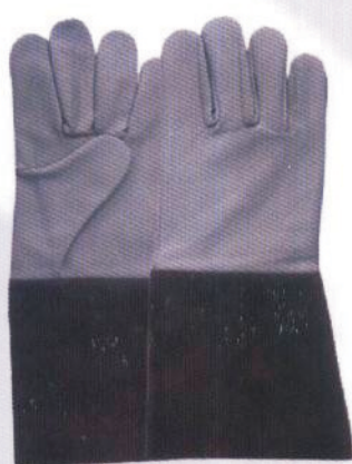
ART # 839