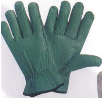
ART # 814