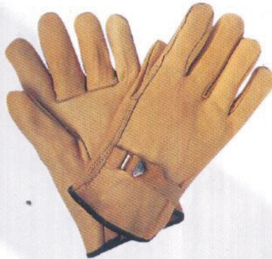
ART # 827