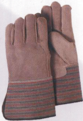
ART # 790