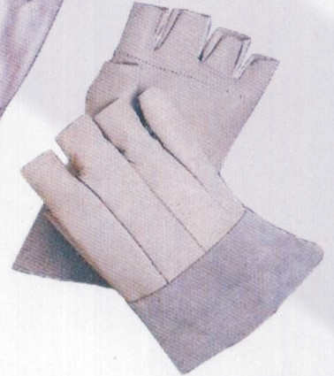
ART # 825