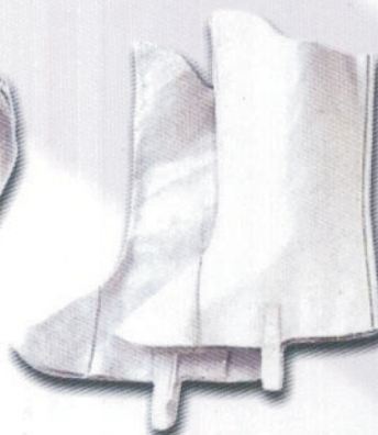
ART # 857