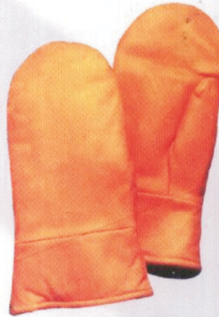
ART # 820