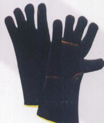
ART # 837