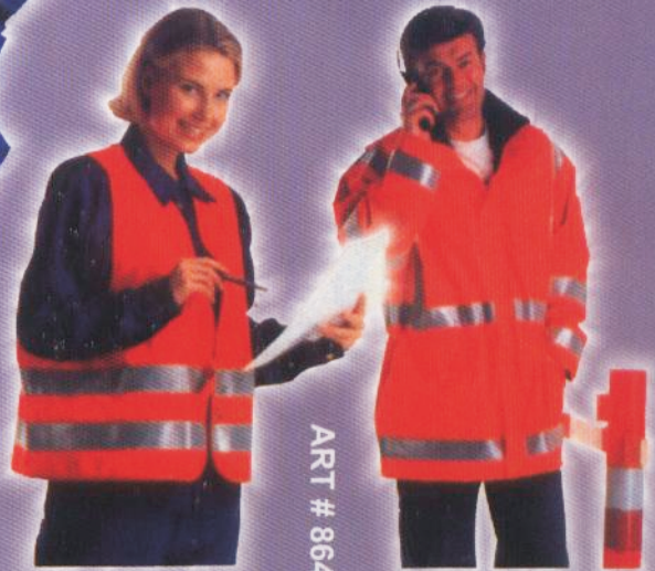
ART # 864

FATIMA PAK GROUP P.O.BOX.406 SIALKOT PAKISTAN E.MAIL fatima@fatimapak.com TEL: 0092 52 4583717 FAX NUMBER: 0092 52 4583717 Mob.0092 300 612 6050 www.fatimapak.com