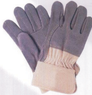
ART # 800