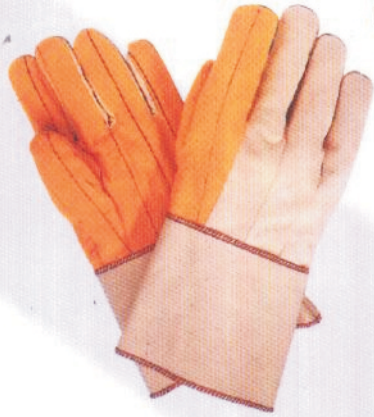
ART # 811