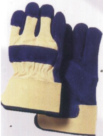
ART # 806