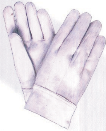
ART # 823