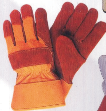
ART # 808