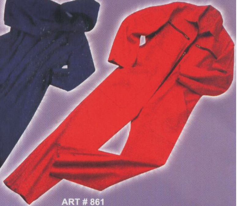
ART # 861