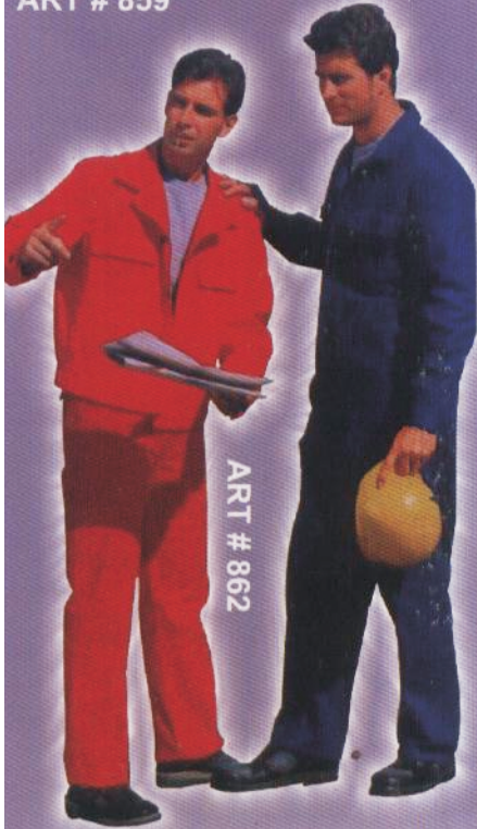
ART # 862