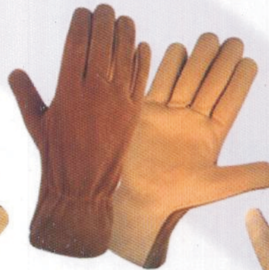
ART # 828