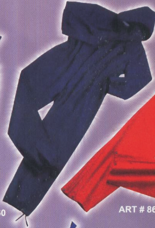
ART # 860