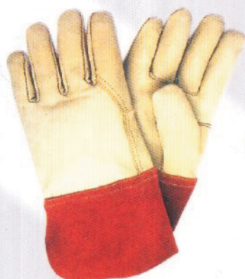
ART # 843