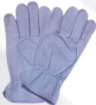
ART # 831