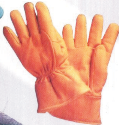
ART # 819