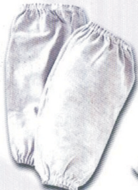
ART # 856