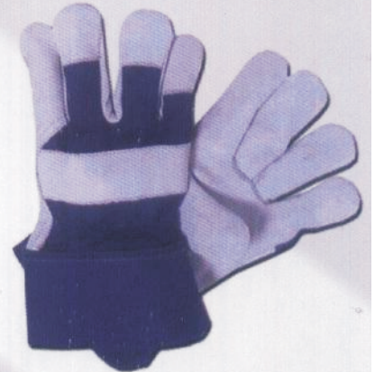
ART # 801