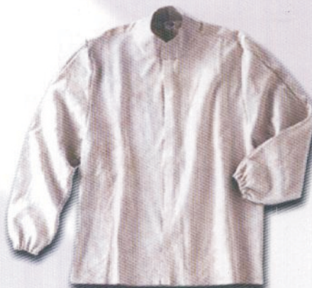
ART # 848