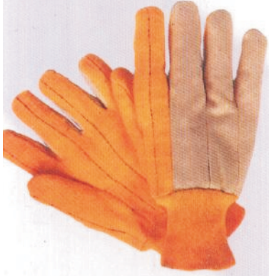
ART # 810