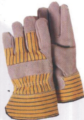
ART # 791