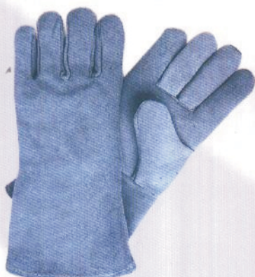
ART # 835