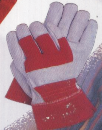
ART # 809