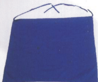
ART # 853