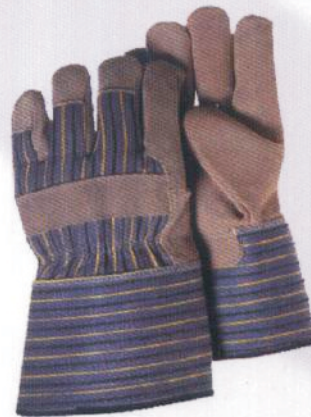
ART # 792