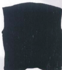
ART # 854