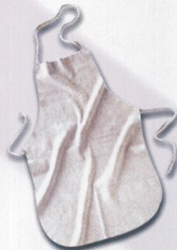
ART # 849