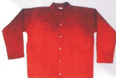
ART # 851