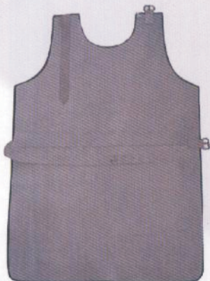
ART # 846