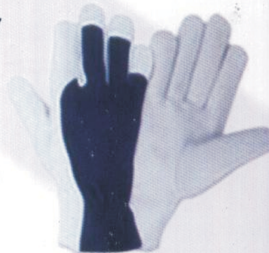
ART # 832