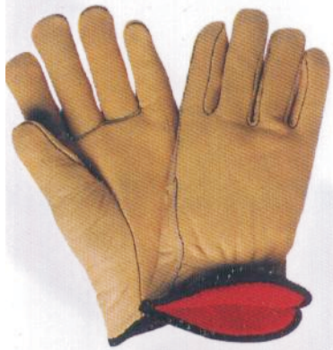
ART # 826