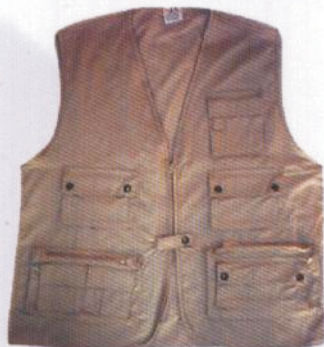
ART # 850