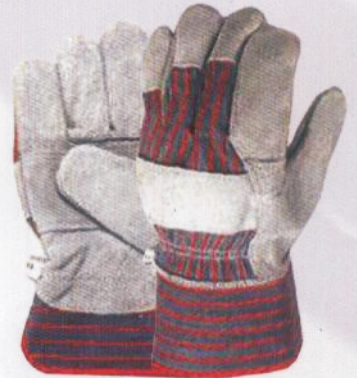
ART # 789