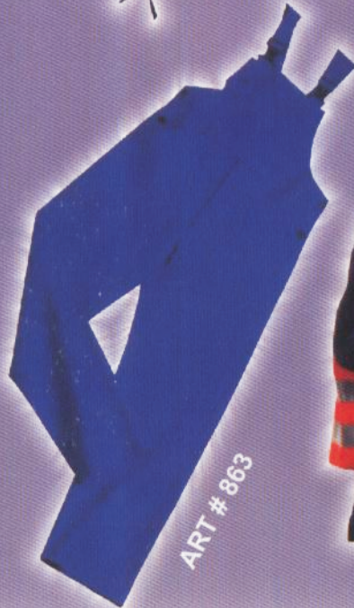
ART # 863