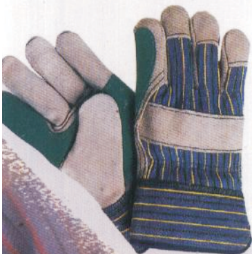
ART # 794