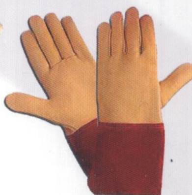
ART # 844