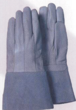
ART # 838