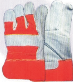
ART # 799