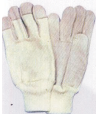
ART # 830