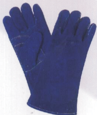
ART # 834