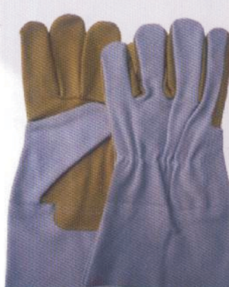
ART # 840