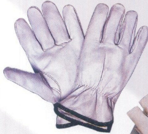
ART # 824