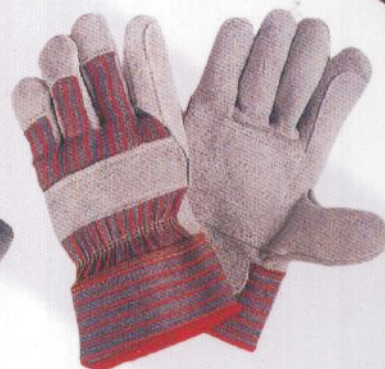
ART # 796