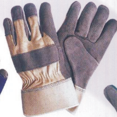
ART # 804