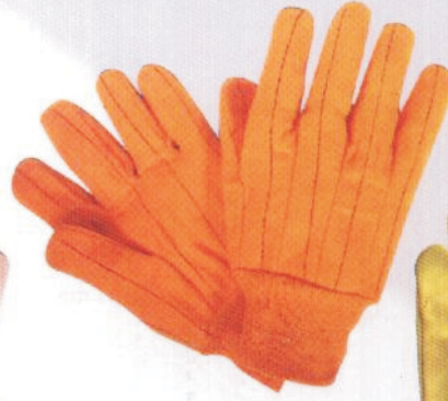
ART # 812