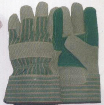
ART # 797