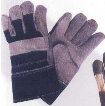
ART # 802