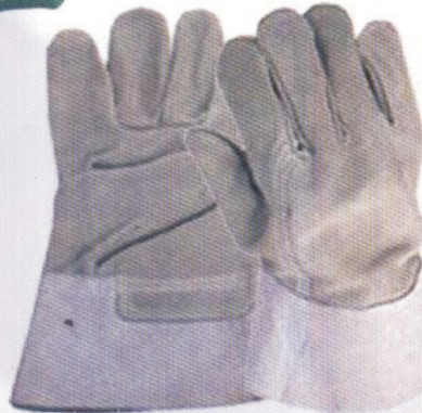
ART # 815