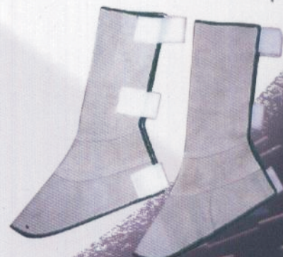
ART # 858