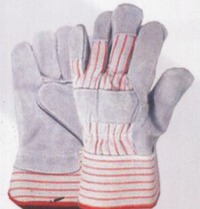
ART # 793