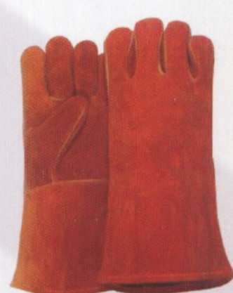
ART # 841