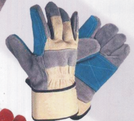
ART # 805