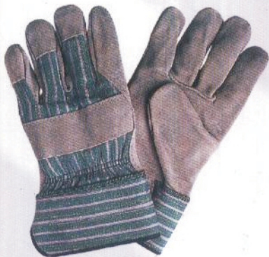
ART # 795