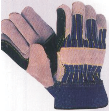
ART # 786