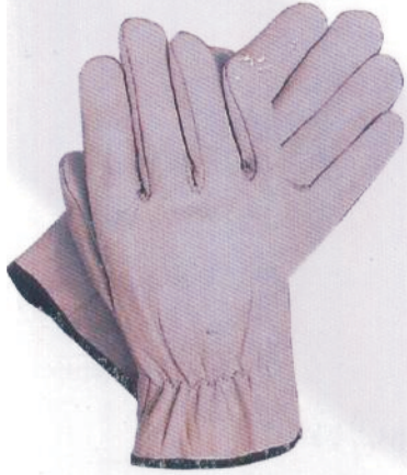
ART # 822