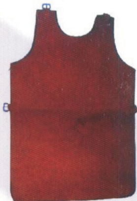
ART # 847