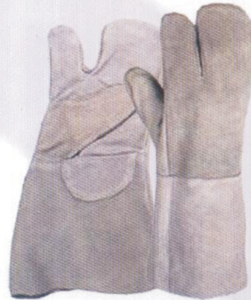
ART # 816