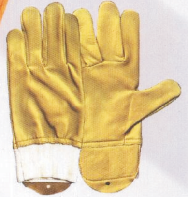
ART # 813