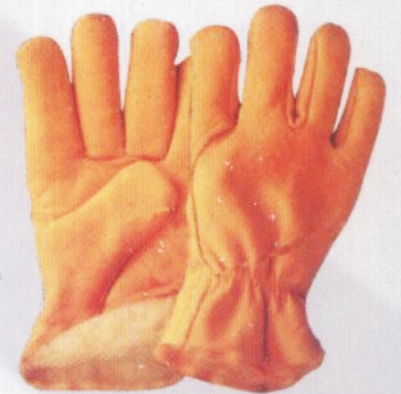
ART # 821