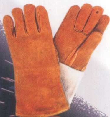
ART # 842