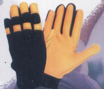
ART # 833