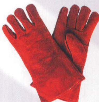
ART # 836