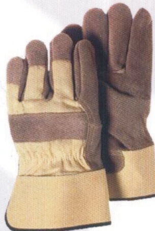
ART # 807