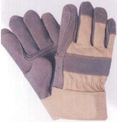
ART # 798