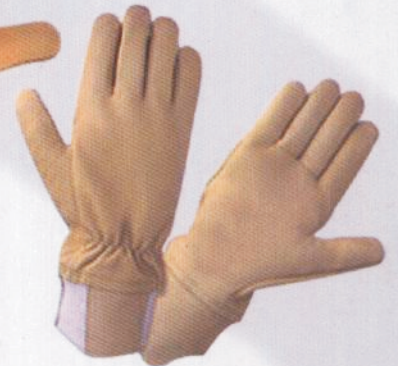
ART # 829