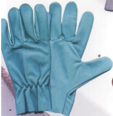
ART # 818