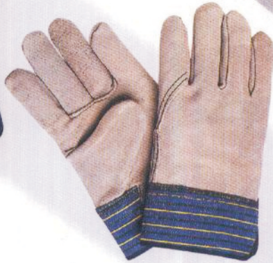
ART # 787