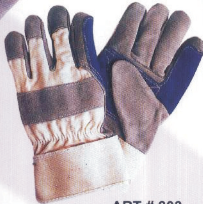
ART # 803