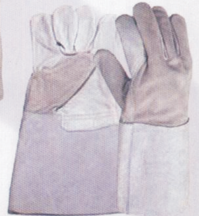
ART # 817