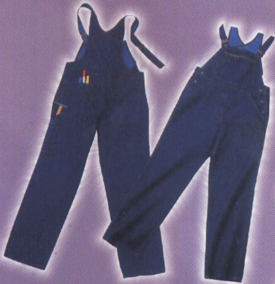
ART # 859