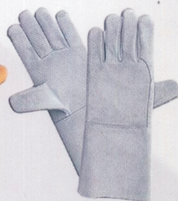
ART # 845